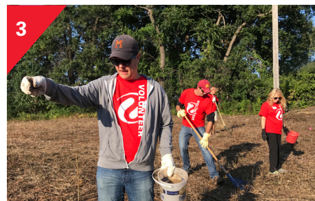
Xcel Energy employees and non-profit organization Great River Greening planted milkweed outside our Blue Lake Power Plant in Shakopee.