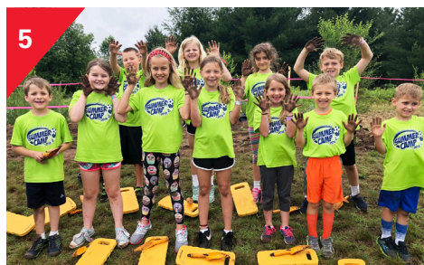
Children helped plant native wildflowers outside our company office in Eau Claire.

Learn more about our pollinator program by visiting xcelenergy.com/Pollinator .