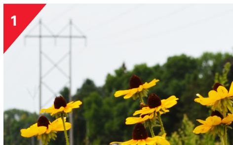
The City of Bloomington partnered with us to plant six acres of pollinator habitat under transmission lines.