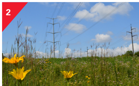
We partnered with the City of Cottage Grove and the Minnesota Department of Natural Resources to restore 60 acres of native prairie habitat under transmission lines.